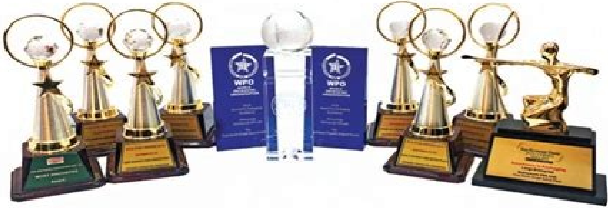
HPPL has received 20 awards comprising some renowned names such as World Star awards, Asian Packaging Excellence Awards, India's Most Trusted Company Award 2019 and National Awards for Excellence in Printing